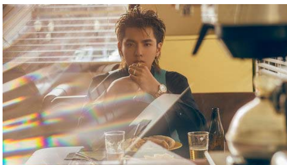
Kris Wu Shares 'November Rain' Music Video From Debut Album, 'Antares': Watch

Further adding to the mystery: Wu's streaming figures are relatively low, with just over 1 million monthly listeners reported on Spotify -- which is not available in China -- and his top Antares tracks on the platform performing well but not exceptionally so.